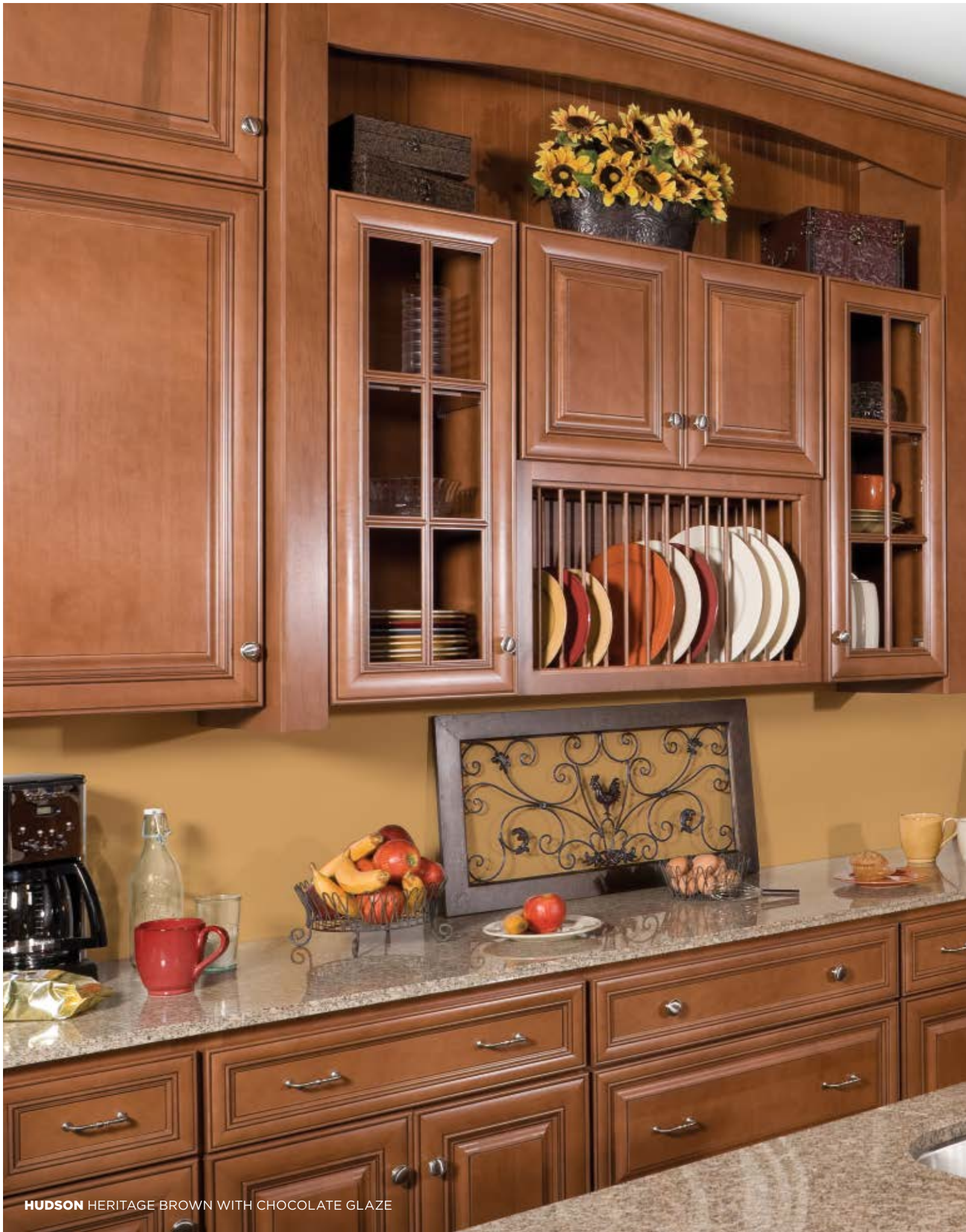
HUDSON HERITAGE BROWN WITH CHOCOLATE GLAZE