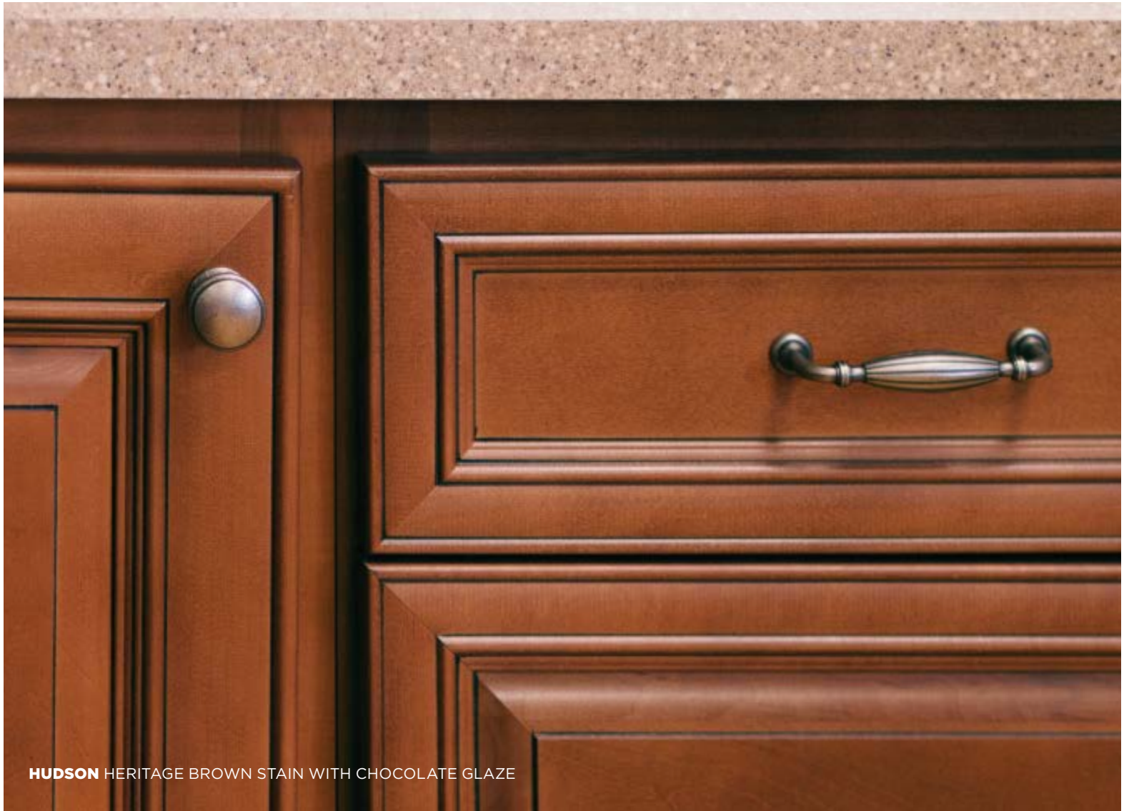
HUDSON HERITAGE BROWN STAIN WITH CHOCOLATE GLAZE