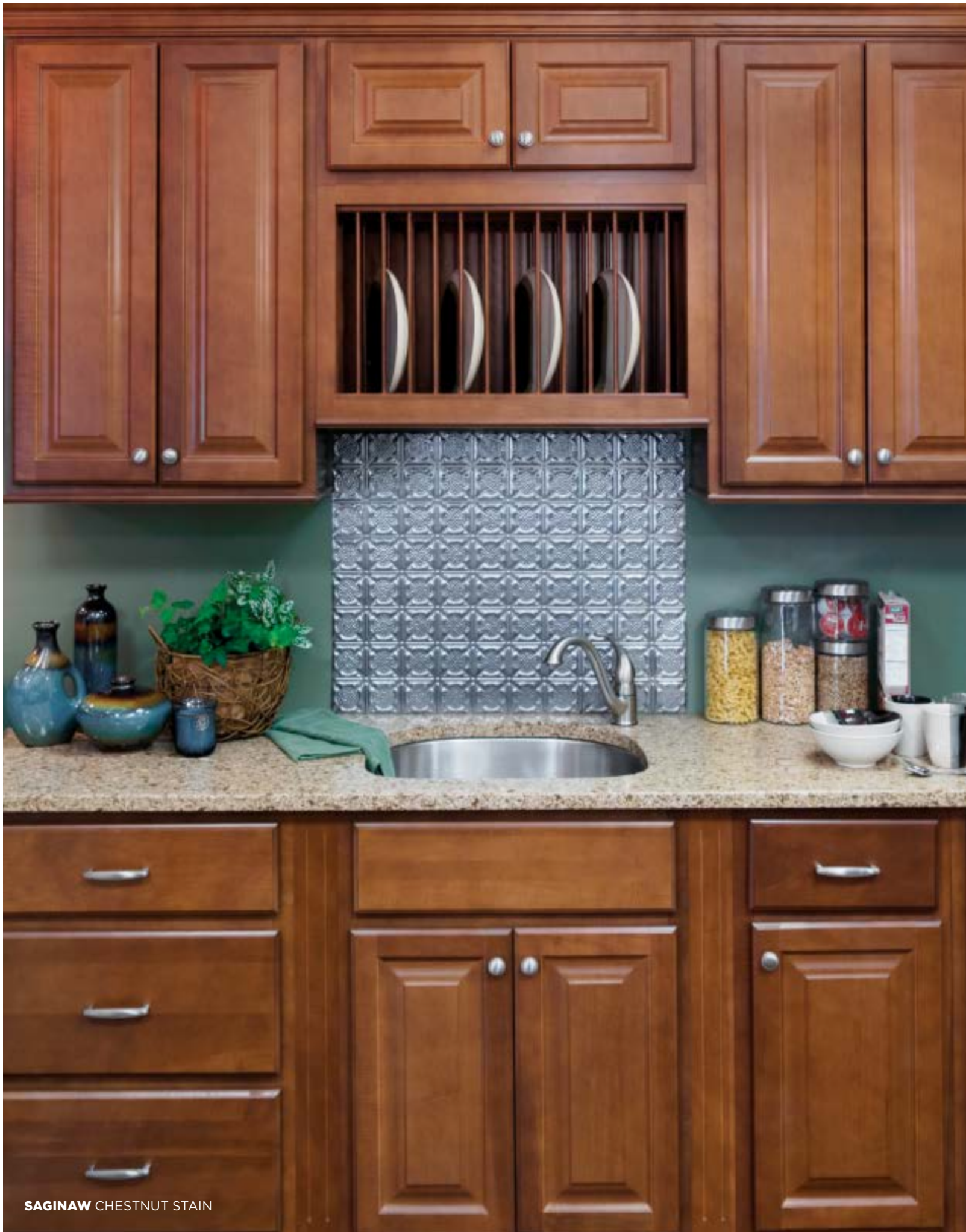
SAGINAW CHESTNUT STAIN