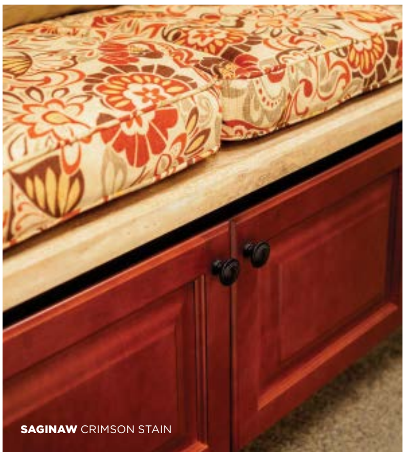
SAGINAW CRIMSON STAIN