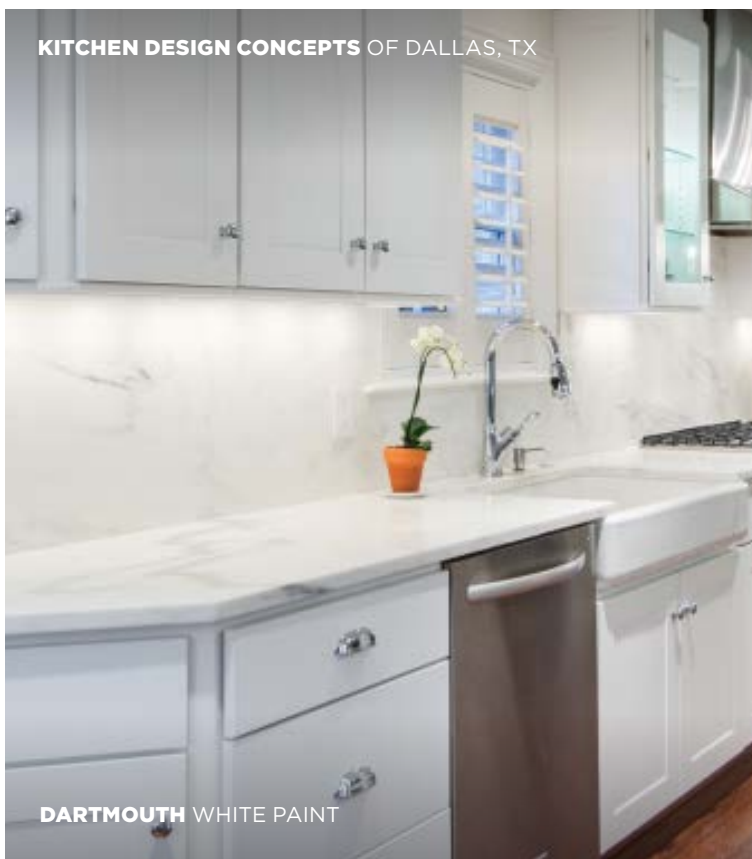
KITCHEN DESIGN CONCEPTS OF DALLAS, TX