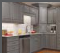
Kitchen & Bath

For a complete line of Wolf products, including these items and more, please visit our website.