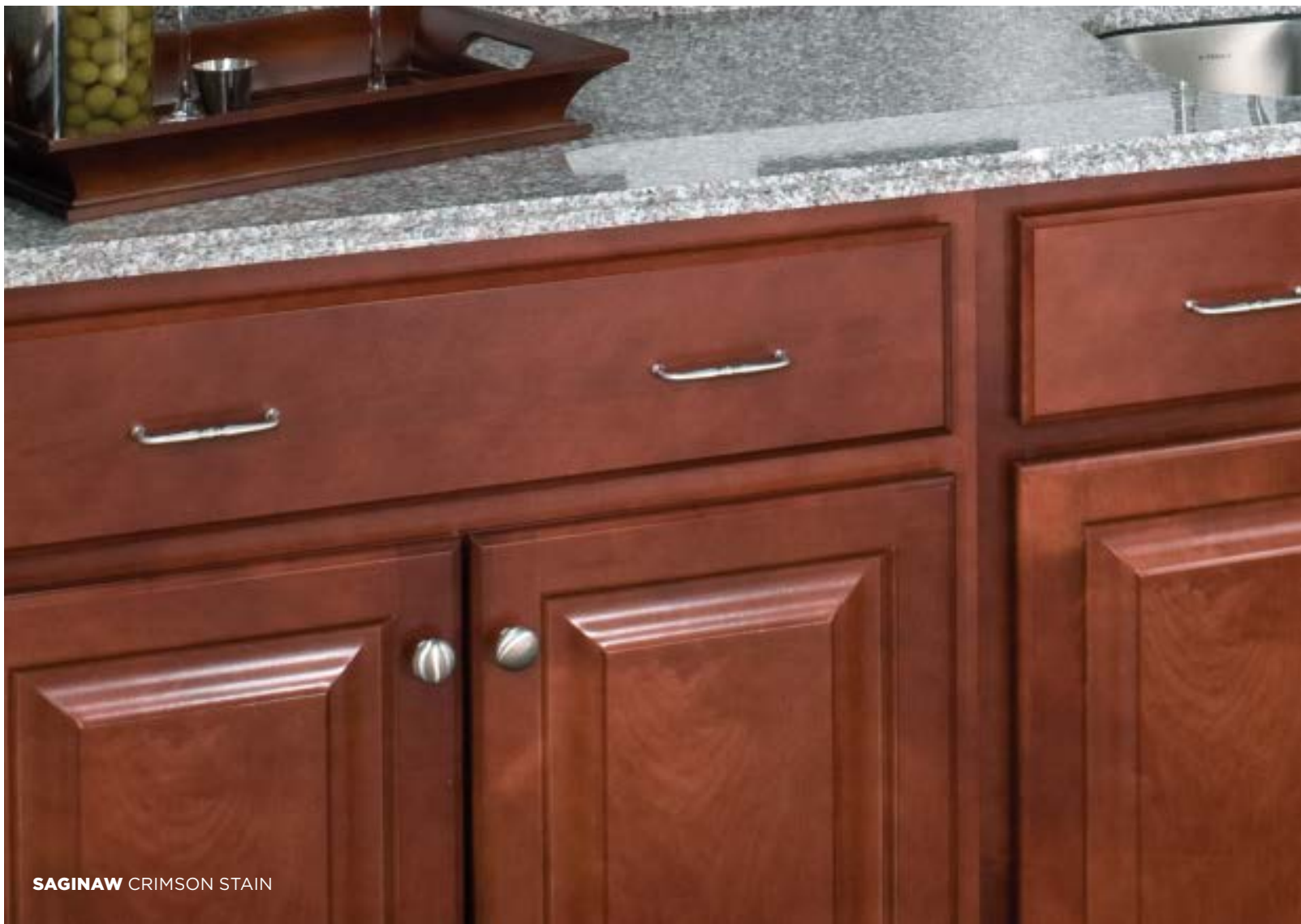
SAGINAW CRIMSON STAIN