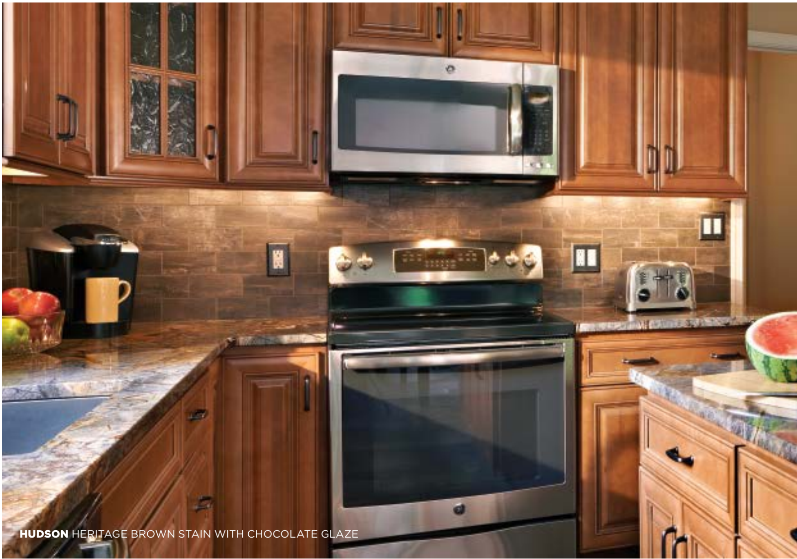
HUDSON HERITAGE BROWN STAIN WITH CHOCOLATE GLAZE