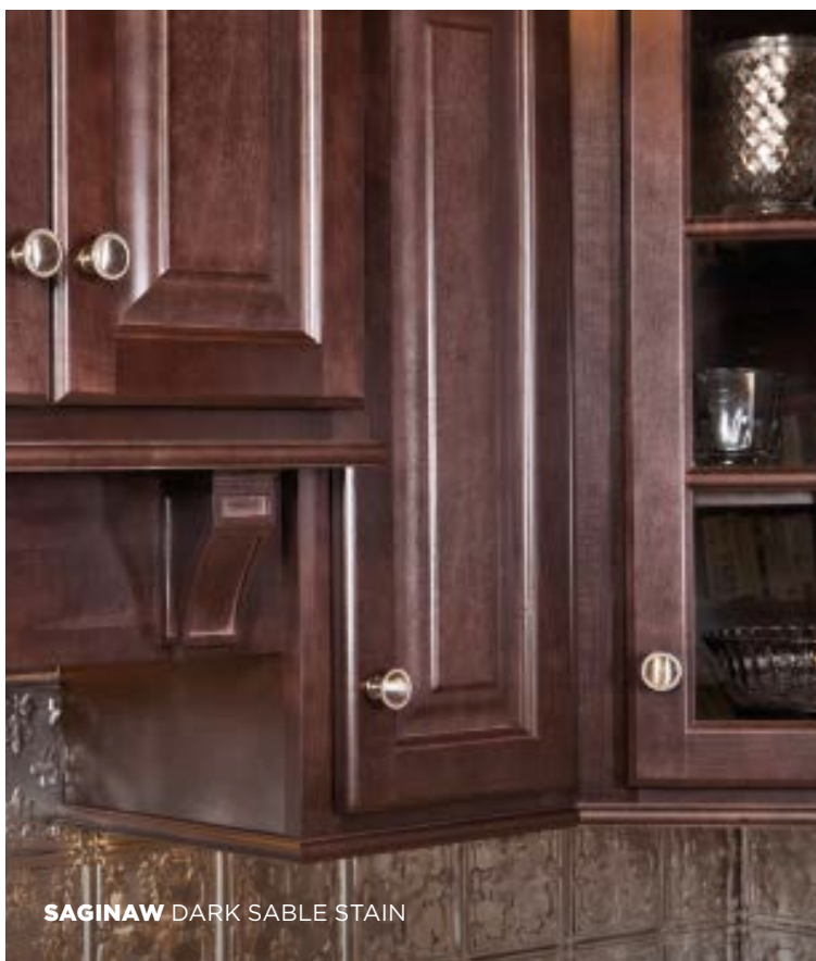
SAGINAW DARK SABLE STAIN