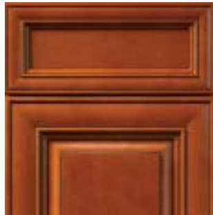
Heritage Brown Stain with Chocolate Glaze