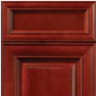
Crimson Stain with Chocolate Glaze