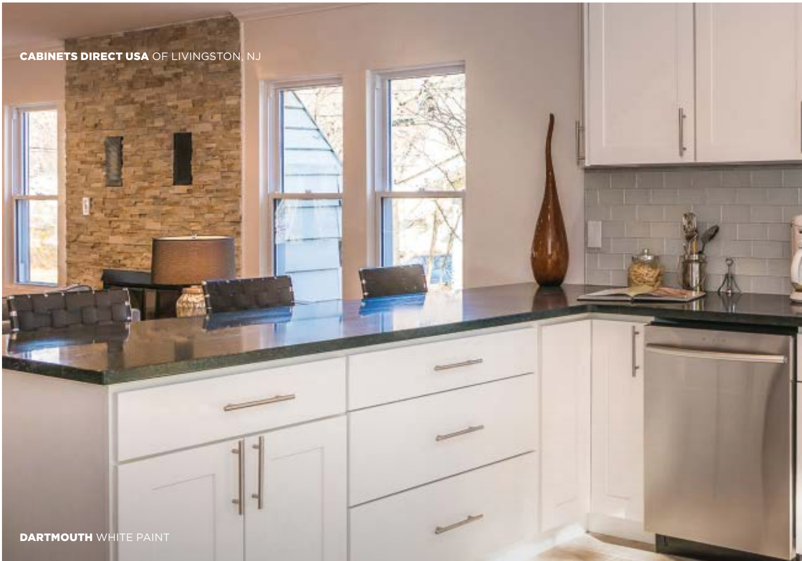
DARTMOUTH WHITE PAINT