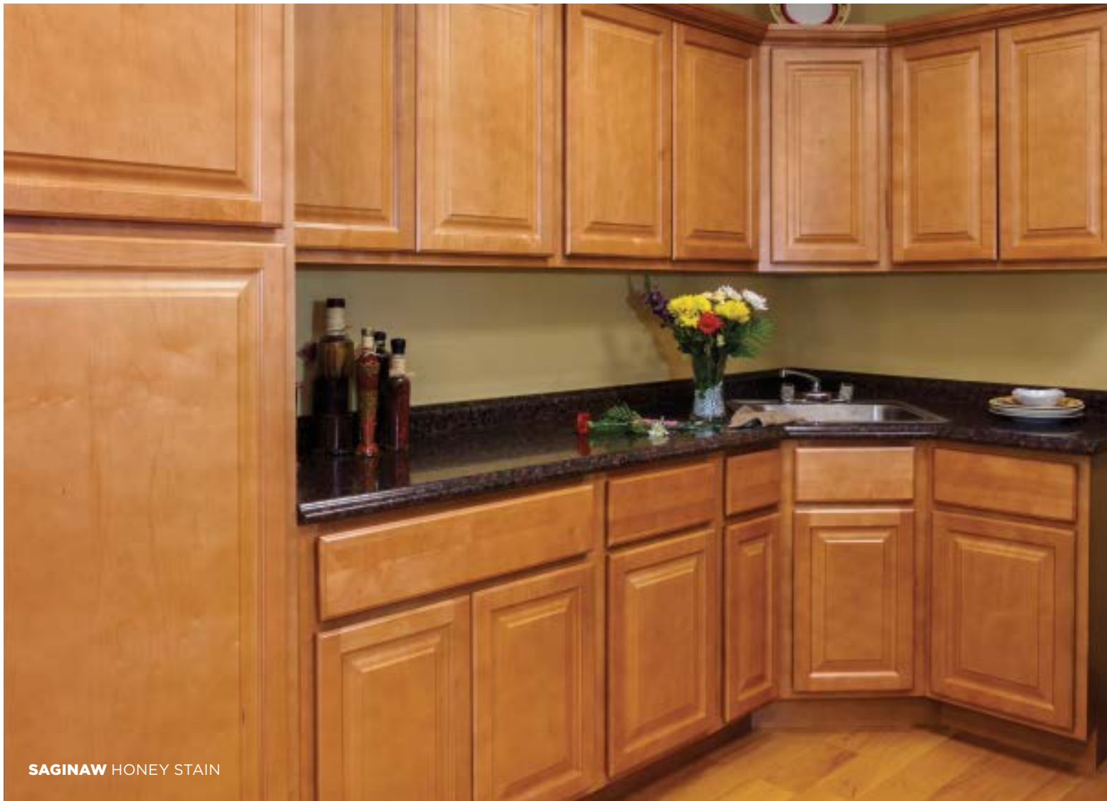
SAGINAW HONEY STAIN