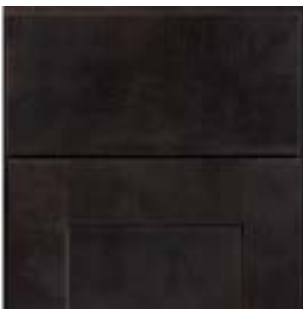
Dark Sable Stain