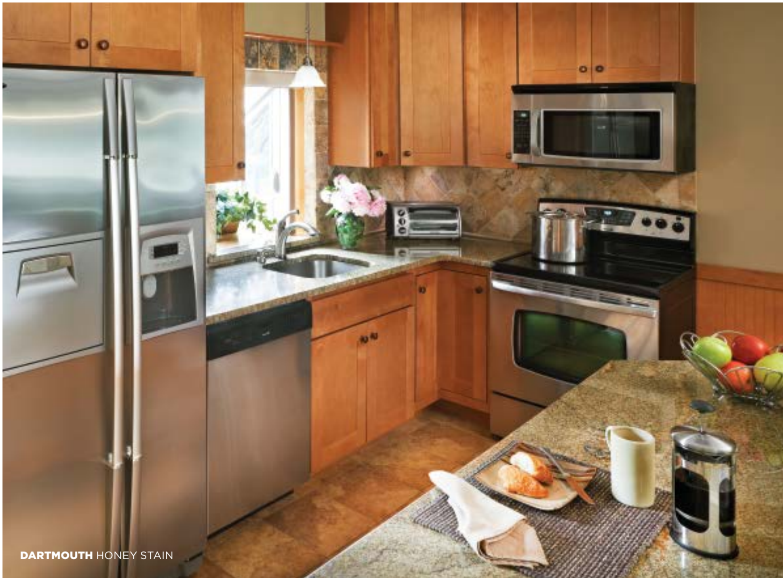
DARTMOUTH HONEY STAIN