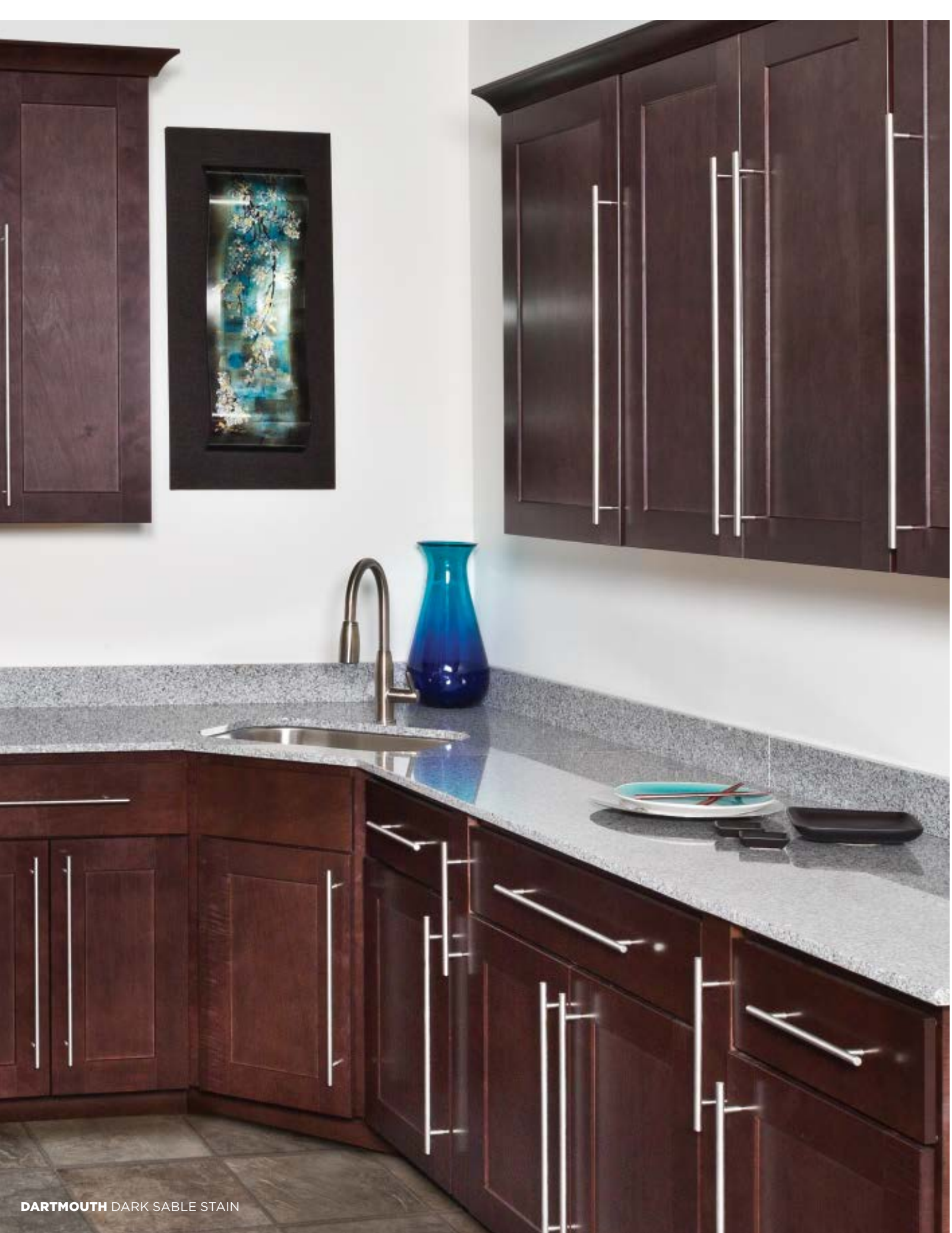
DARTMOUTH DARK SABLE STAIN