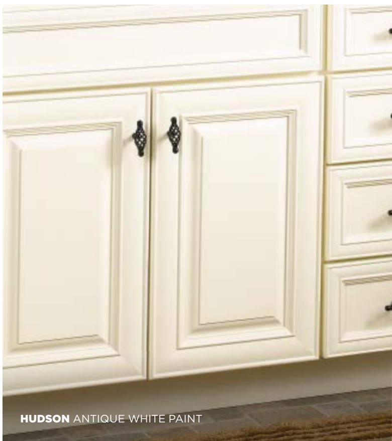
HUDSON ANTIQUE WHITE PAINT