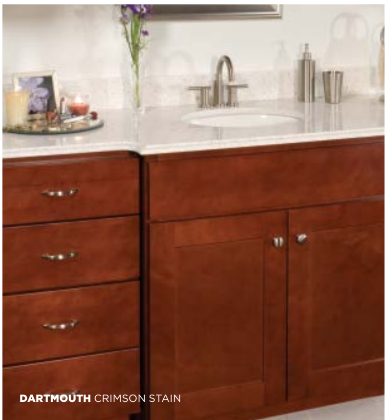
DARTMOUTH CRIMSON STAIN