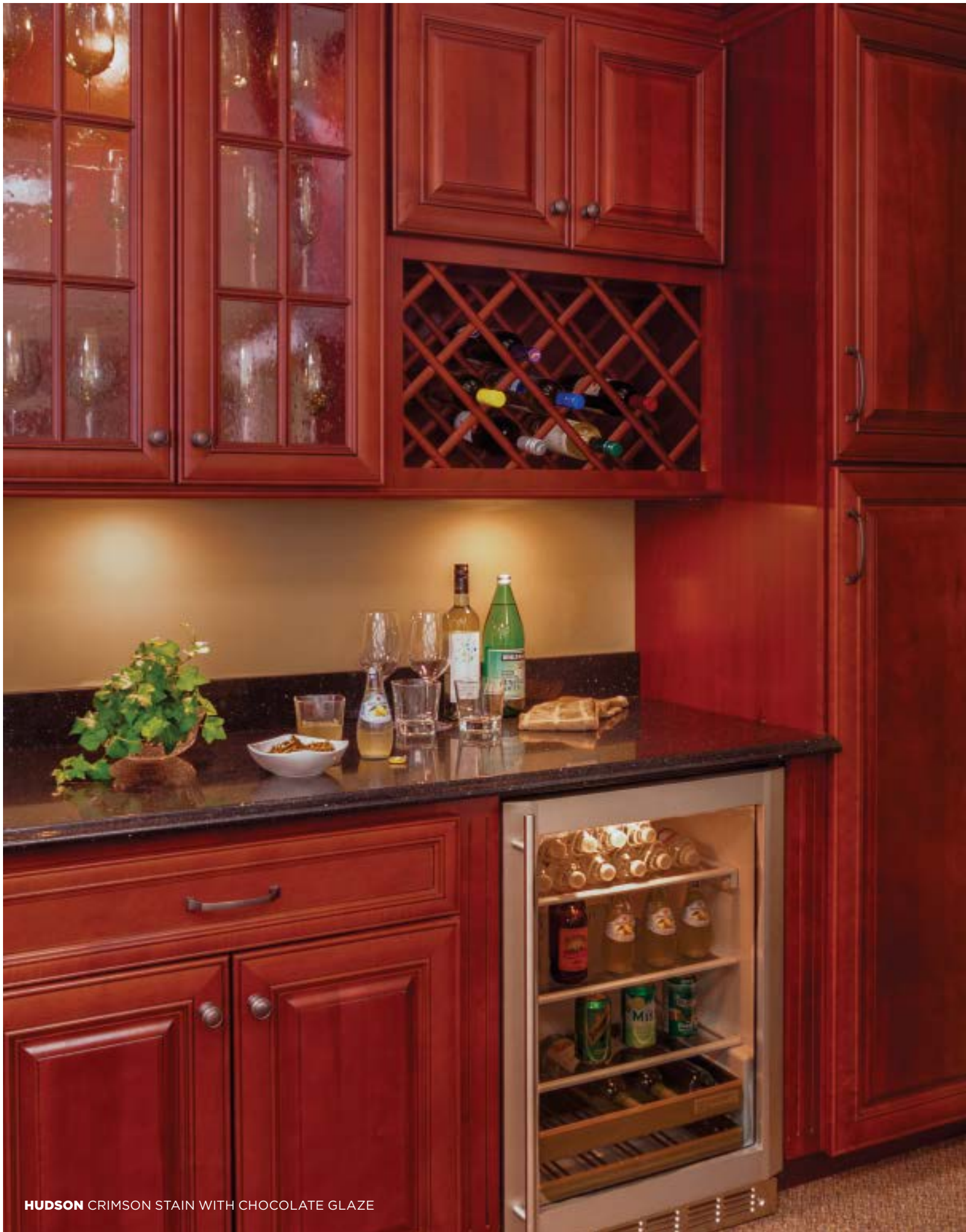
HUDSON CRIMSON STAIN WITH CHOCOLATE GLAZE