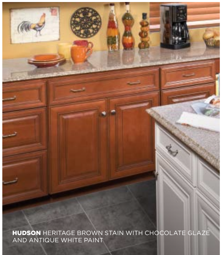
HUDSON HERITAGE BROWN STAIN WITH CHOCOLATE GLAZE AND ANTIQUE WHITE PAINT