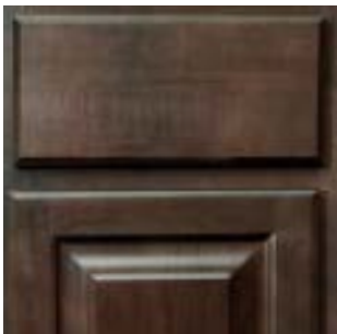
Dark Sable Stain