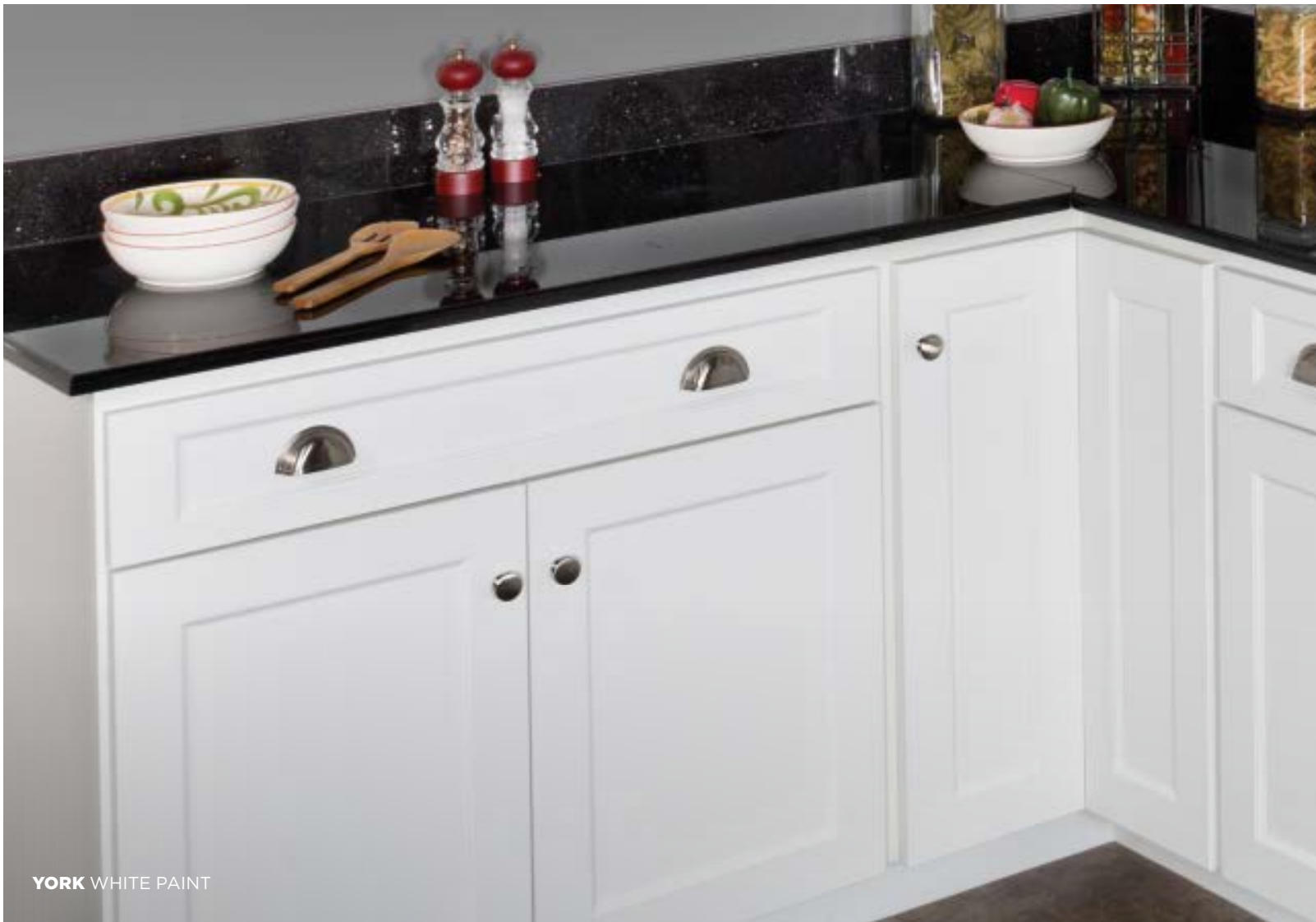
YORK WHITE PAINT